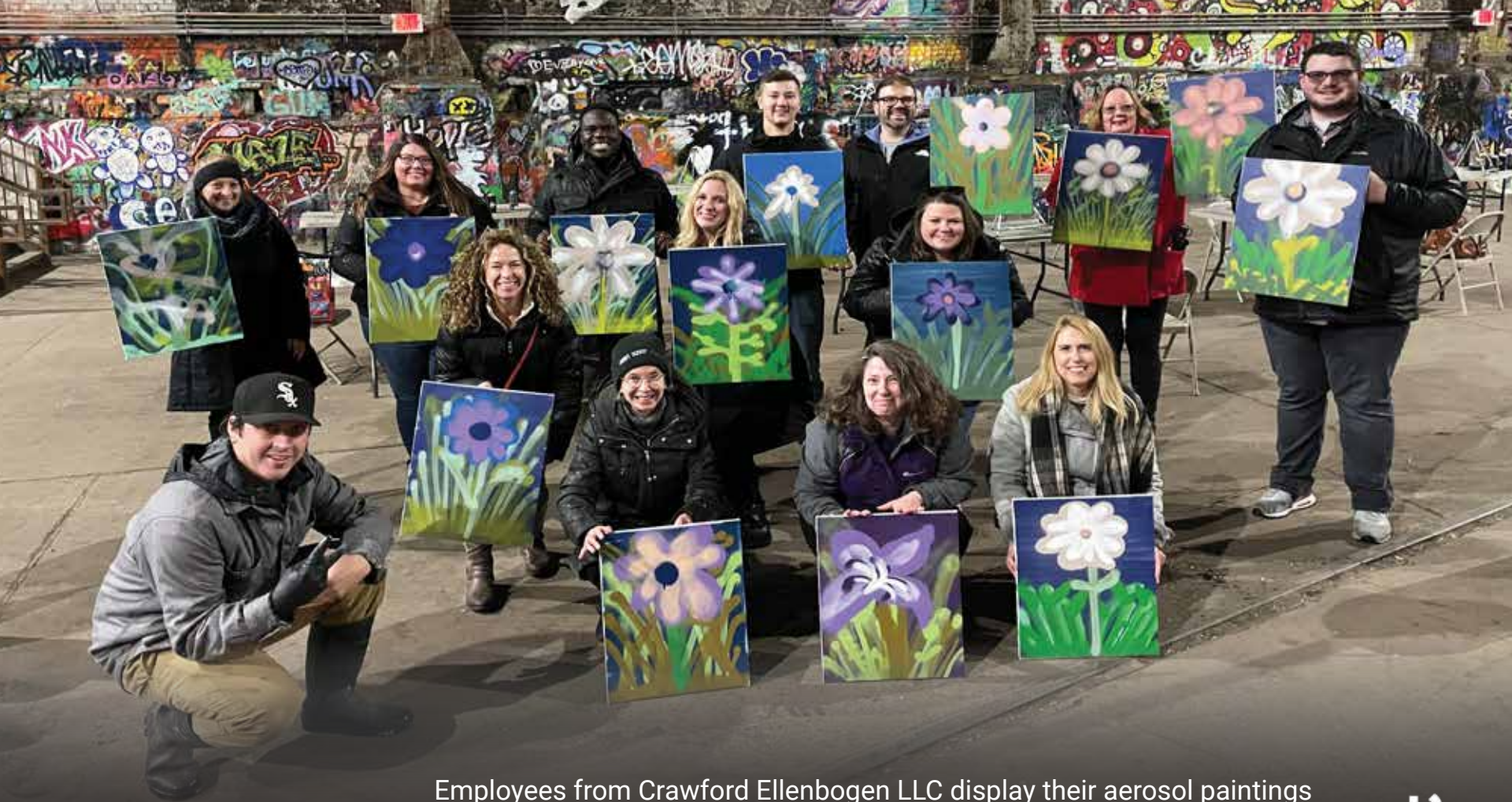
Employees from Crawford Ellenbogen LLC display their aerosol paintings created during a Graffiti Art team-building workshop at the Carrie Blast Furnaces.