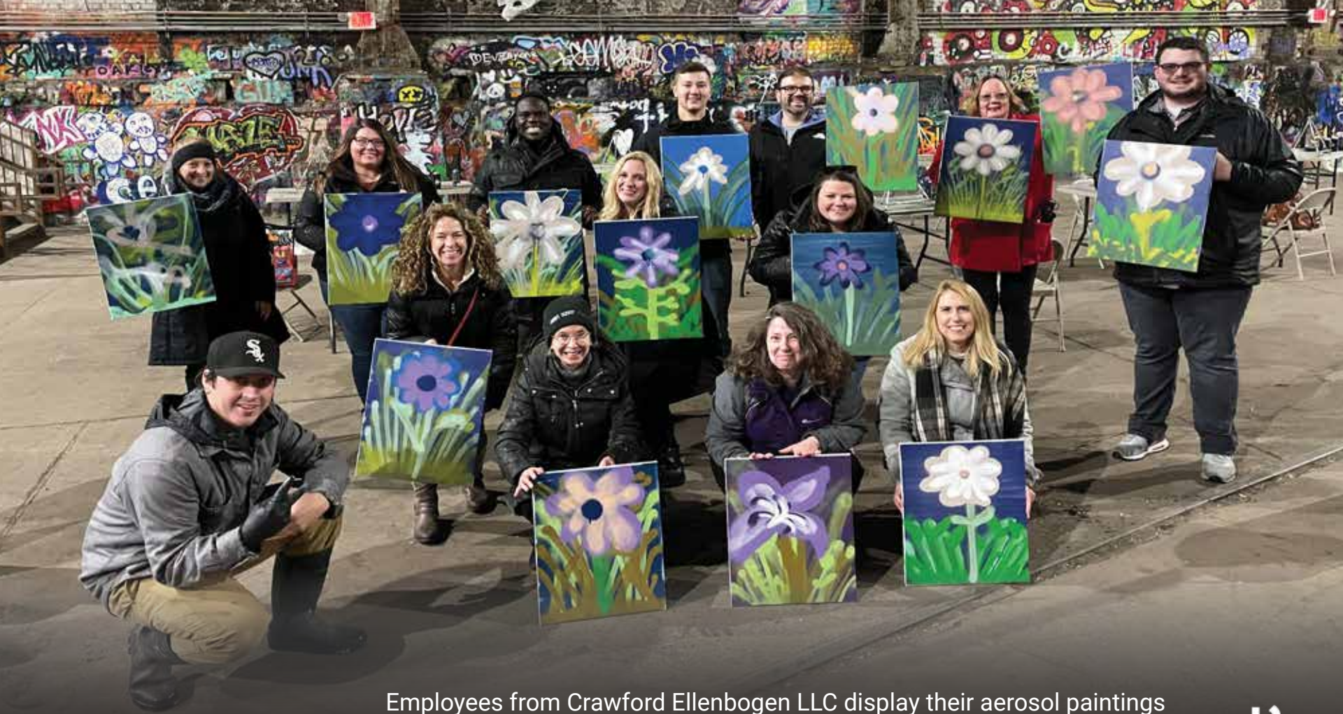
Employees from Crawford Ellenbogen LLC display their aerosol paintings created during a Graffiti Art team-building workshop at the Carrie Blast Furnaces.